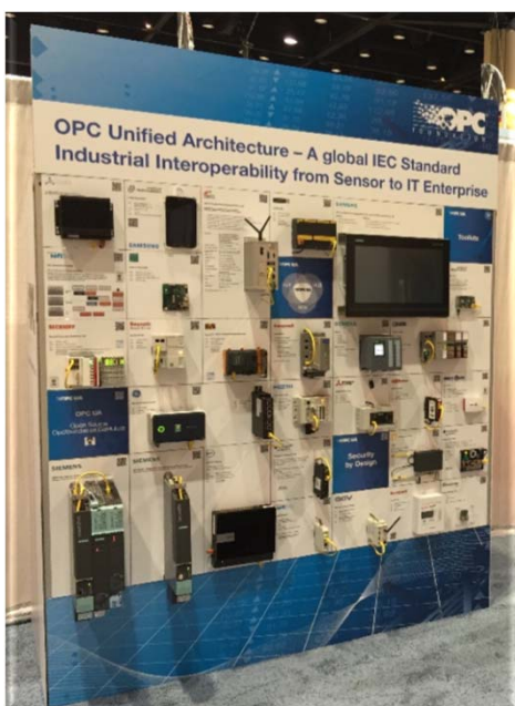
North American Demo wall @ IMTS Chicago 2016