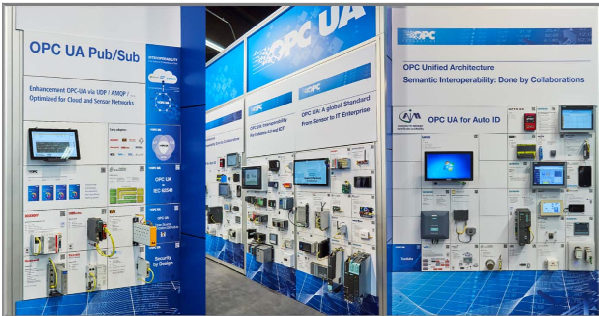
European Demo wall @ SPS IPC Drives 2016

This document is about how to get your company logo with your OPC UA enabled device to the wall. Please note this opportunity is exclusive for OPC members only.