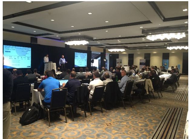
Table top exhibit includes: